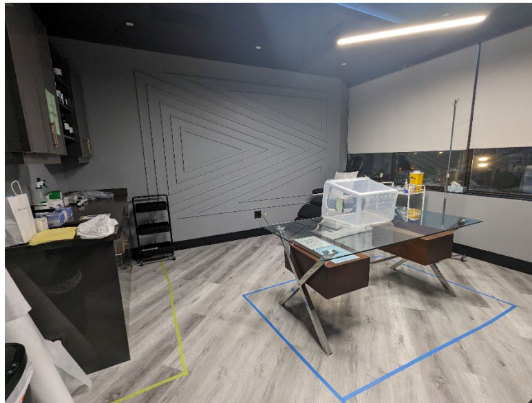
Figure 1. Clinic room. For the purposes of the exam, the area marked with green tape will represent the anteroom, and the area marked with blue tape will represent the buffer room.