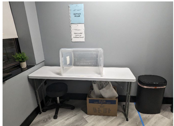
Figure 3. Mock laminar airflow hood set-up